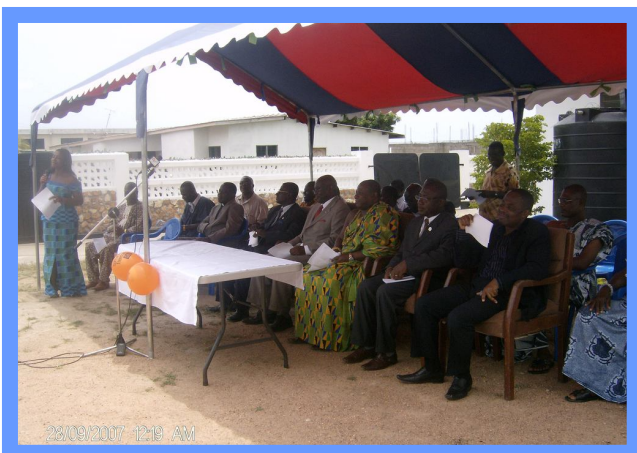
5. Dignitaries and Community leaders seated at the High table during the commissioning of the WODiV facility.