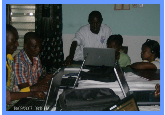
2. UEW students browsing at the WODiV facility.