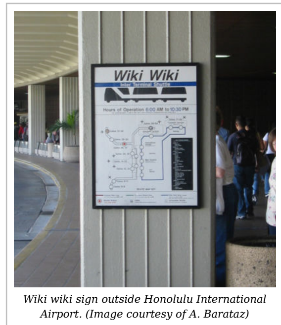
Wiki wiki sign outside Honolulu International Airport.

The main strength of a wiki is that it gives people the ability to work collaboratively on the same document. The only software you need is an Internet browser. Consequently, wikis are used for a variety of purposes. If you make a mistake, it's easy to revert back to an earlier version of the document.