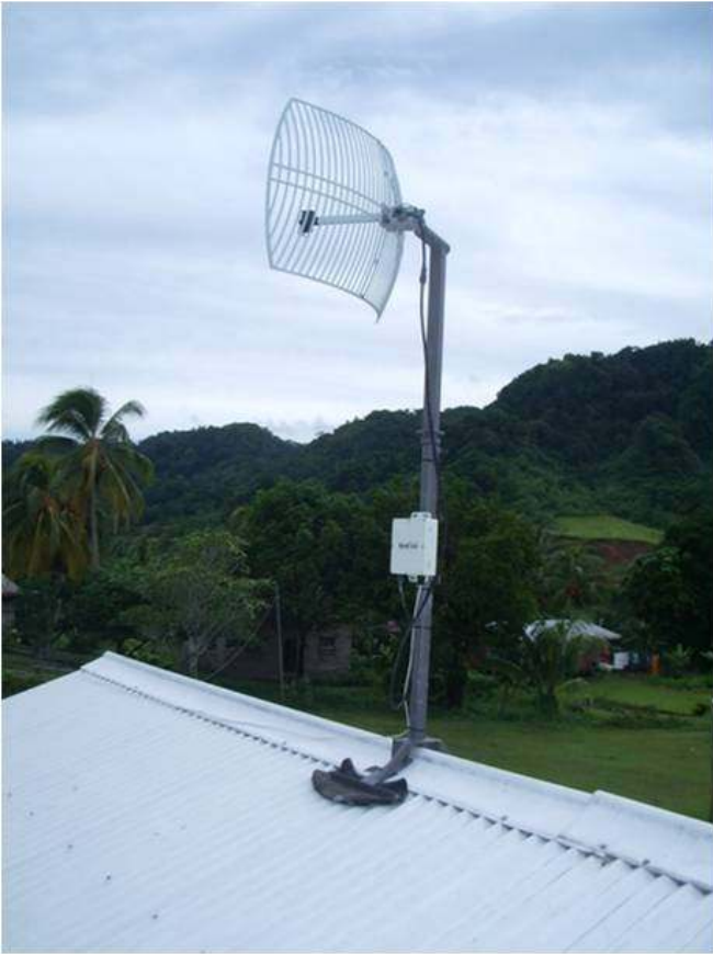
Wi-Fi antenna connecting Batuna to Mt. Mariu AP

On the left is an example of the low-cost Wi-Fi equipment needed to connect each school/community. If low-power computers (netbooks) are used, the solar power supply needed is also low-cost. The range is up to 50km as long as there is line of sight. (Toa Marovo has almost 360 degrees view of central Marovo). For locations only a few km away from the AP, even lower cost plastic antennas can be used. Note also that Uepi Resort is able to mobilise guests to donate equipment.