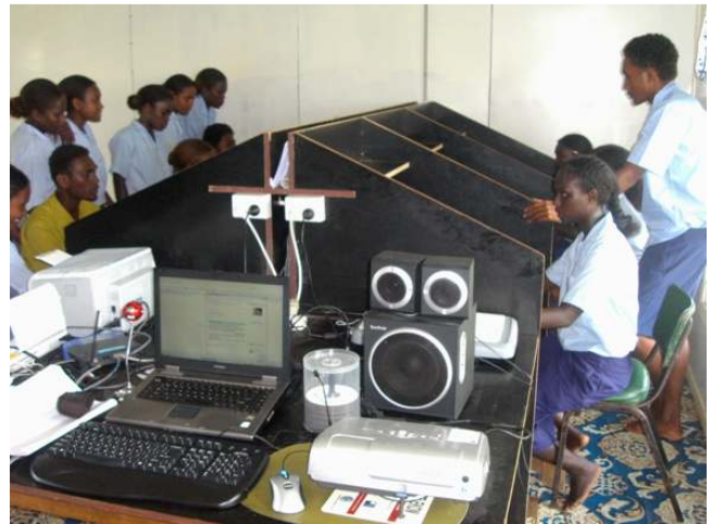
Pictures of Bekabeka DLC in 2007/8. More on Bekabeka DLC: http://peoplefirst.net.sb/DLCP/Western.htm

Currently (Oct 2010) the Bekabeka DLC and Mount Mariu access point are no longer fully operational.