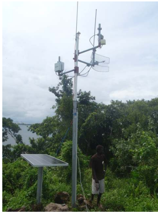
The Wi-Fi mast at Toa Marovo. This is connected to the RICS via a bridge. It is solar powered, has operated autonomously for 2 years, and provides line-of-sight coverage with almost 360 degree view, to sites up to 40km or more. So far two villages, a resort and a clinic have been connected.