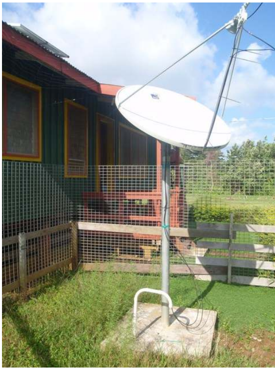
The RICS VSAT at Patukae. This is solar powered and has been running since early 2008. The school computer lab is to be installed in the office shown, by Scots College. The OLPC school server will also be housed in the office.