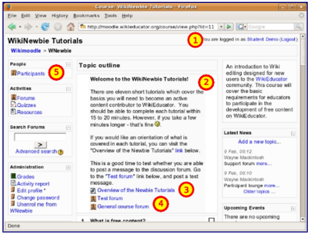
The participant's view. Refer to the key below