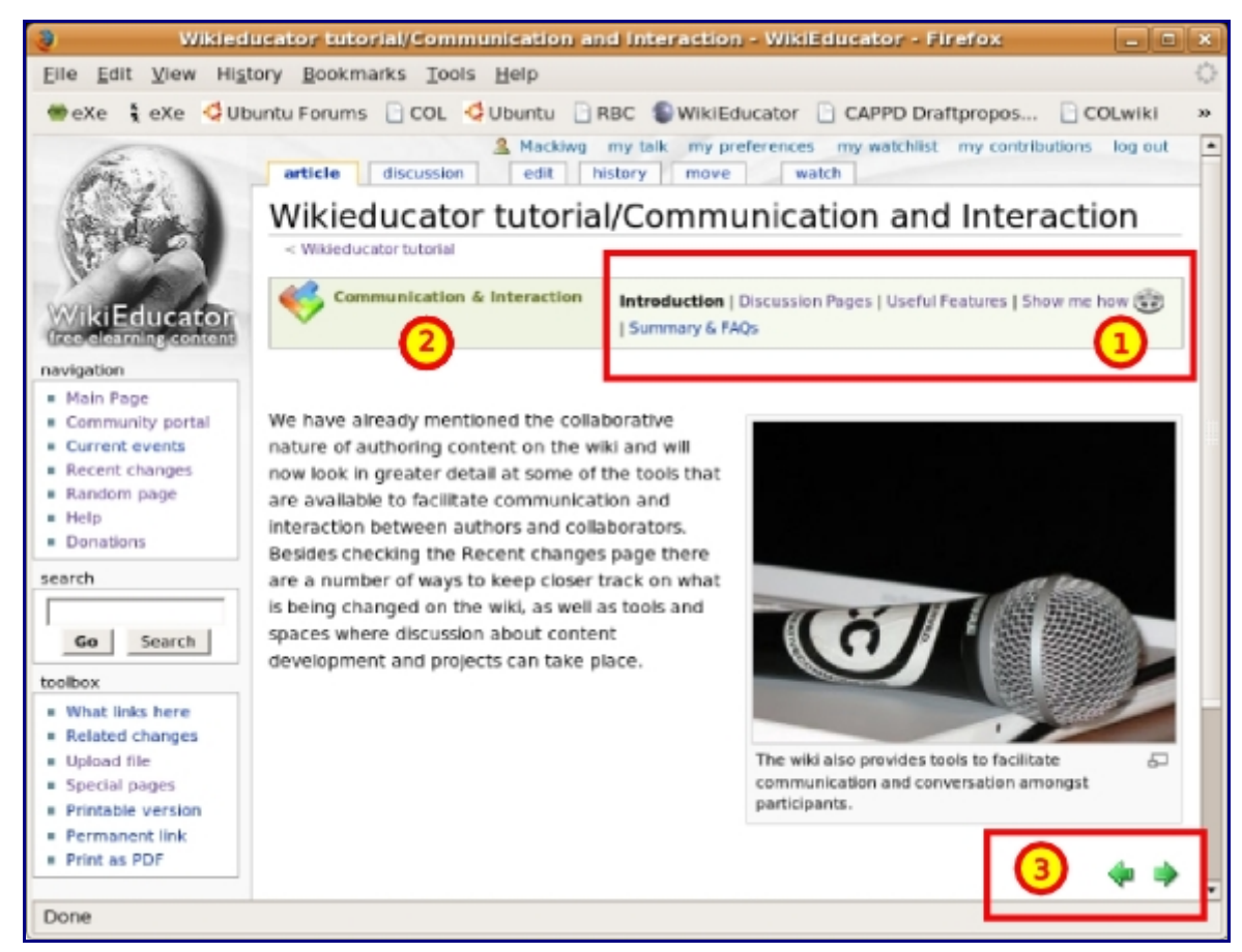
Navigation options for Newbie Tutorials. See key below