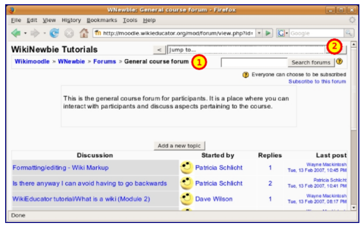
Moodle Navigation Features See key below