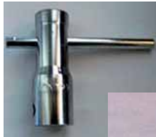
Two types of plug spanner

You also need a spark plug spanner/wrench to fit your type of spark plug (16 mm and 21 mm hex/nut sizes are the most common)